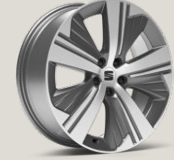
EXCLUSIVE 19" MACHINED AEROWHEEL