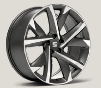
SUPREME 20" MACHINED ALLOY WHEELS