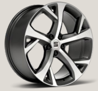
EXCLUSIVE 19" MACHINED ALLOY WHEELS