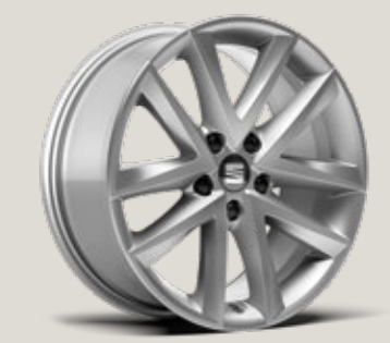
DYNAMIC 17" ALLOY WHEELS