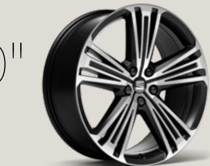
SUPREME 20" MACHINED ALLOY WHEELS