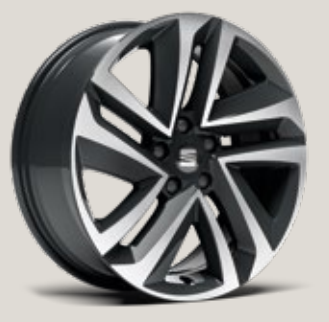
PERFORMANCE 18" MACHINED ALLOY WHEELS ST